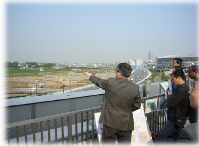
Field Trip in Tsurumi River Retarding basin