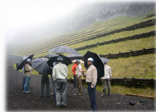
Field Trip in Nikko Sabo Works