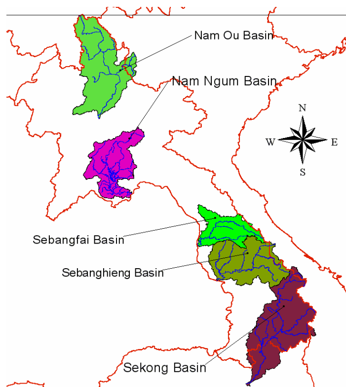
Fig No.1: Location of Nam Ngum River Basin

The Nam Ngum Basin is formed by two rivers as Nam Ngum is the main and its tributary called Nam Lik.